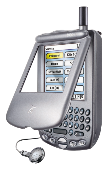
Treo 270 has a built-in, backlit keyboard, making one-handed access to key functions easy and thumb typing fast—even in the dark.

The Handspring<sup>™</sup> Treo<sup>™</sup> 270 color communicator does it all. Now you can have your phone, Palm OS<sup>®</sup> organizer, email, SMS text messaging, and wireless Web in one amazingly compact and indispensable device—in full-color.